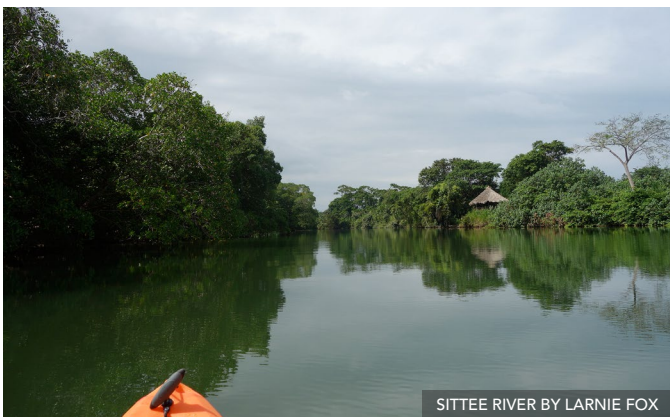
SITTEE RIVER BY LARNIE FOX

This program includes optional carbon offsetting with ClimateSafe. Learn more at holbrooktravel.com/climatesafe