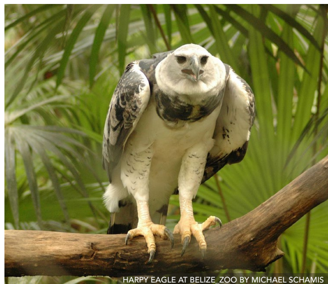
HARPY EAGLE AT BELIZE ZOO

This morning, go birding along the trails of Caves Branch Lodge. The lodge estate is nearly 50,000 acres, and you may see Lesson's Motmot and Keel-billed Toucan, among many other avian species. Have some time at leisure to enjoy the amenities before lunch at the lodge. This afternoon, embark on