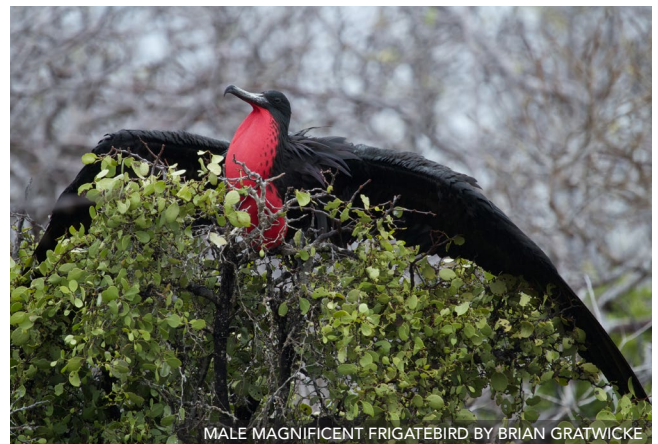
MALE MAGNIFICENT FRIGATEBIRD

Through multifaceted activities, this eco-adventure showcases Belize's biodiversity, archaeological treasures, and cultural and natural wonders as you explore coastal, riverine, rainforest, and urban landscapes. Also included is a full-day excursion to Guatemala's Mayan ruins at Tikal, a UNESCO World Heritage Site. The pacing is leisurely, beginning with a night in Belize City followed by two three-night stays. There is one boating excursion to a reserve on Belize's Barrier Reef, where you may swim and snorkel. Other activities include cave tubing, birdwatching, wildlife viewing, hiking, and river kayaking. Active periods may last from 2–6 hours per day, balanced with free time to relax and enjoy your lodge facilities. Belize is typically hot and humid; the cooler dry season is generally between November and early May, when there is less rain and average daily highs in the mid-80s. There are two border crossings; one internal connecting flight; and several overland transfers lasting 1–4 hours in private, air-conditioned motorcoaches.